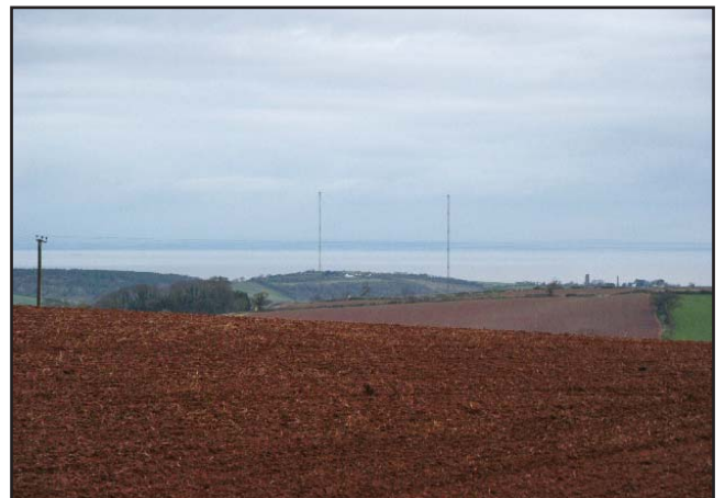
High open hills provide clear views to the Bristol Channel and to prominent vertical features sited not far from the National Park boundary.