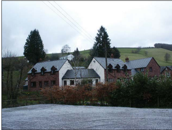
Modern housing at Luxborough (using locally distinctive slate and red sandstone).