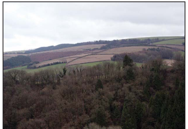
The linear and geometric lines of game crops are often at odds with the rounded topography and organic forms in the landscape.