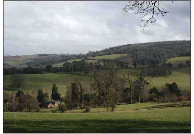
Coniferous and deciduous woodland drapes over the hilltops. Farms and settlements nestle in the foothills.