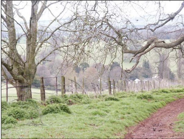
Declining estate railing at Nettlecombe.