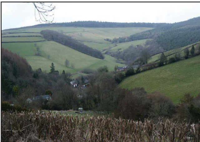
Hamlets and small villages are strung along the well-treed intimate valley floors.