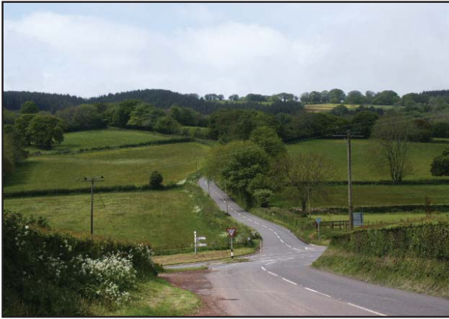
Entrance to the National Park at Elworthy Cross offers clear views over the well-wooded hills and farmland.