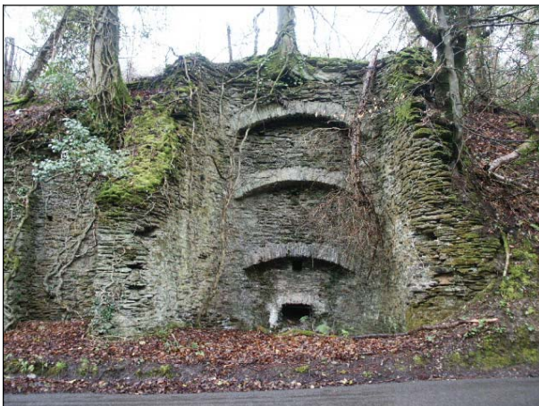
Lime kiln and disused quarries at Treborough.