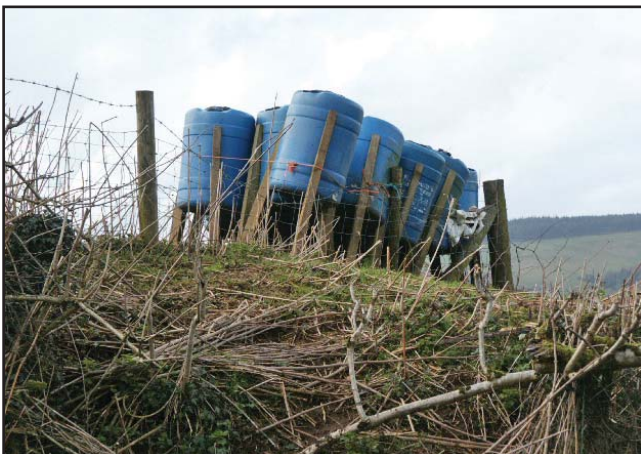
Game feeders (often brightly coloured) are seen throughout the landscape.