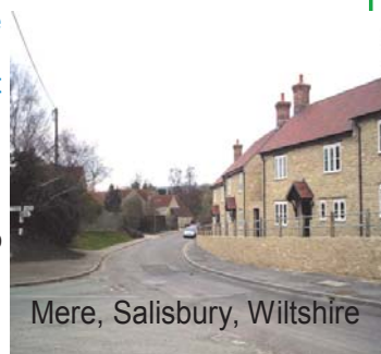
Mere, Salisbury, Wiltshire

This involves identifying sites, and assessing their suitability for housing and liaising with landowners, planners, housing strategy officers, the local community, to bring these sites forward.